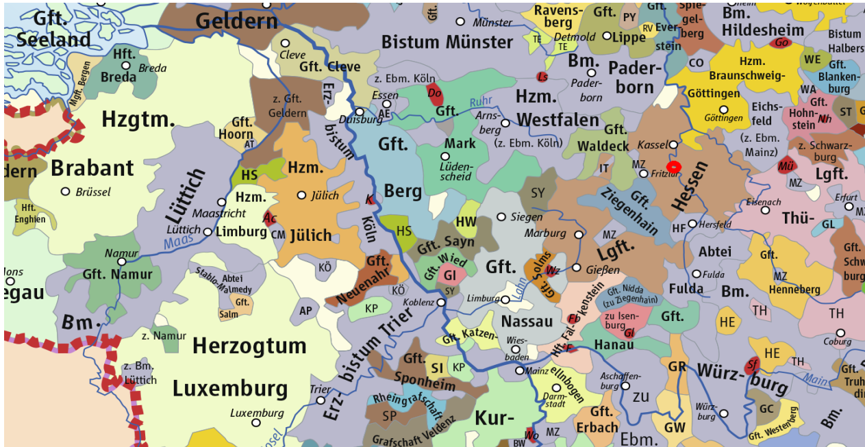
The Landgrafschaft Hessen (light-brown) and surrounding duchies and counties around 1400. Many lands are owned by various bishoprics (Bistum, B.m., Ebm., or Abtei)

On the map duchies (ruled by a duke) are labelled Herzogtum (HZGTM, Hzm) and counties (ruled by a count) are labelled Gft. or Lgft. Substantial lands, shown in blue-grey, belonged to the catholic church and its bishops [Bistum, Bm] or cloisters [Abtei]. Some bishops had rights that could be inherited [Erz-bistum, Ebm, Ebft]. Some rulers made donations to the church to gain favors or imposed as a penalty. They accumulated much wealth. The Archbishop of Mainz (an inheritable position), at the confluence of the Main and Rhine rivers to the south-west of Ober-Hessen, was also able to collect tolls from traffic on the Rhine river, wound up with lands to the north-east of Nieder-Hessen, the Eichsfeld region. It stayed catholic throughout the later thirty-years war, as did the many the Wiederholds living there, while Hessen turned protestant.